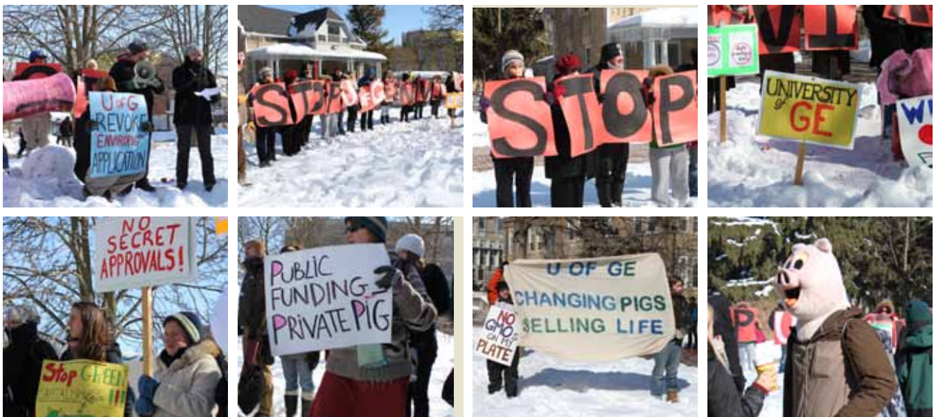
A cold February day can't stop Canadians! The banner pictured here is a spoof on the official slogan “University of Guelph: Changing Lives, Improving Life.” The Big Carrot in Toronto hired a bus to help urban consumers join farmers and students at the protest!