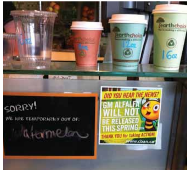
The Big Carrot's juice bar shares the news of campaign success with customers! (Toronto)

of federal regulation. He said: “the applicants raised several valid issues that clearly fall outside the scope of the narrow federal safety assessment. Issues related to sustainable and organic agriculture, increased herbicide use, and related social and economic effects play no role in the federal approval process for GE crops.”