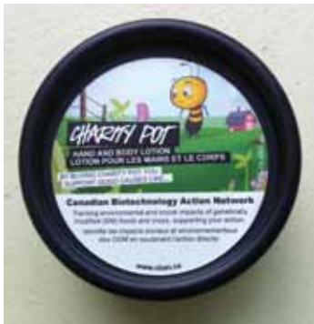
LUSH Fresh Handmade Cosmetics supported CBAN through their Charity Pot program. Here is CBAN's hand and body lotion!

The Bernard and Edith Ennis Foundation The Big Carrot Natural Market, Toronto Canadian Health Food Association Community Natural Foods Calgary Inter Pares Julie Daniluk Consulting LUSH Fresh Handmade Cosmetics Nature's Path New Roots Herbal Ontario Natural Food Co-op Patagonia Inc.